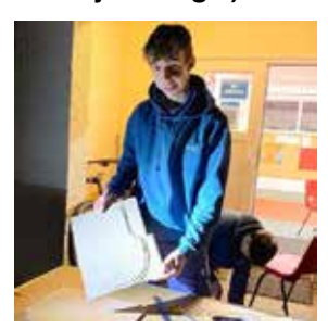
The Explorers keeping busy last term!

It's here – the year you've all been waiting for! It's 2021! At the time of writing (December) I don't know whether we'll be in another lockdown, free of restrictions on in the weird grey area in the middle. Whatever happens, we'll still be Scouting this month. 2021 is set to be a great year for the group: the leaders have been working on new activities for our young people to enjoy; we've begun planning and looking at putting on some brilliant trips for our young people; we look forward to opening our hut to a wider number of groups as residentials at the hut resumes; and we look forward to welcoming even more adult volunteers on our adventure.