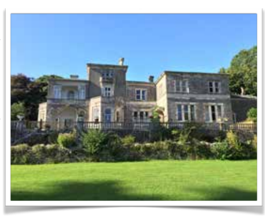
Pinhay House Care Home

In February 2020 we were warned by local health professionals that the coronavirus was spreading quickly and could be lethal to elderly and frail members of society.